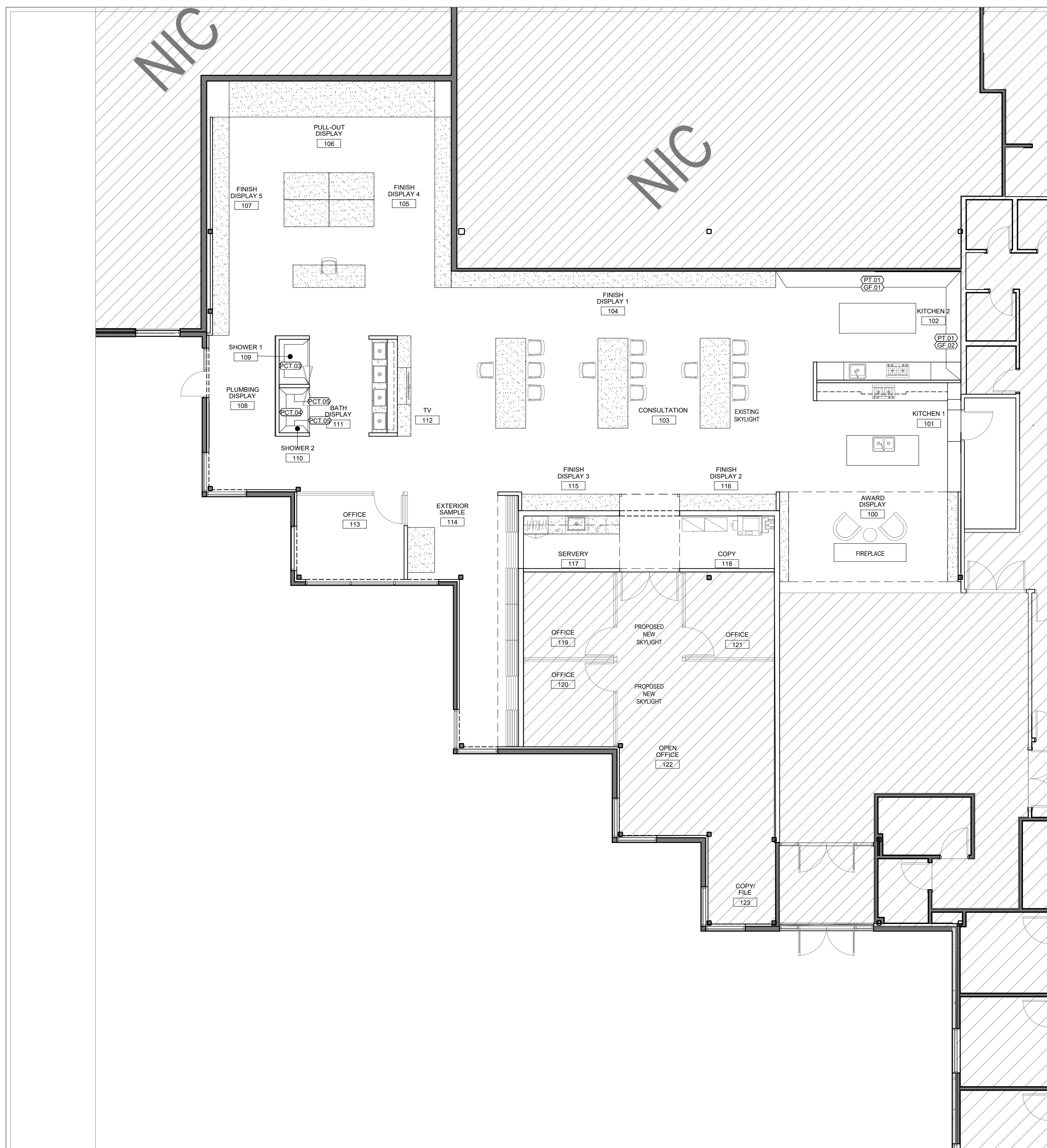
1 FURNITURE/ LIFE AND SAFETY PLAN SCALE: 1/8" = 1'-0"